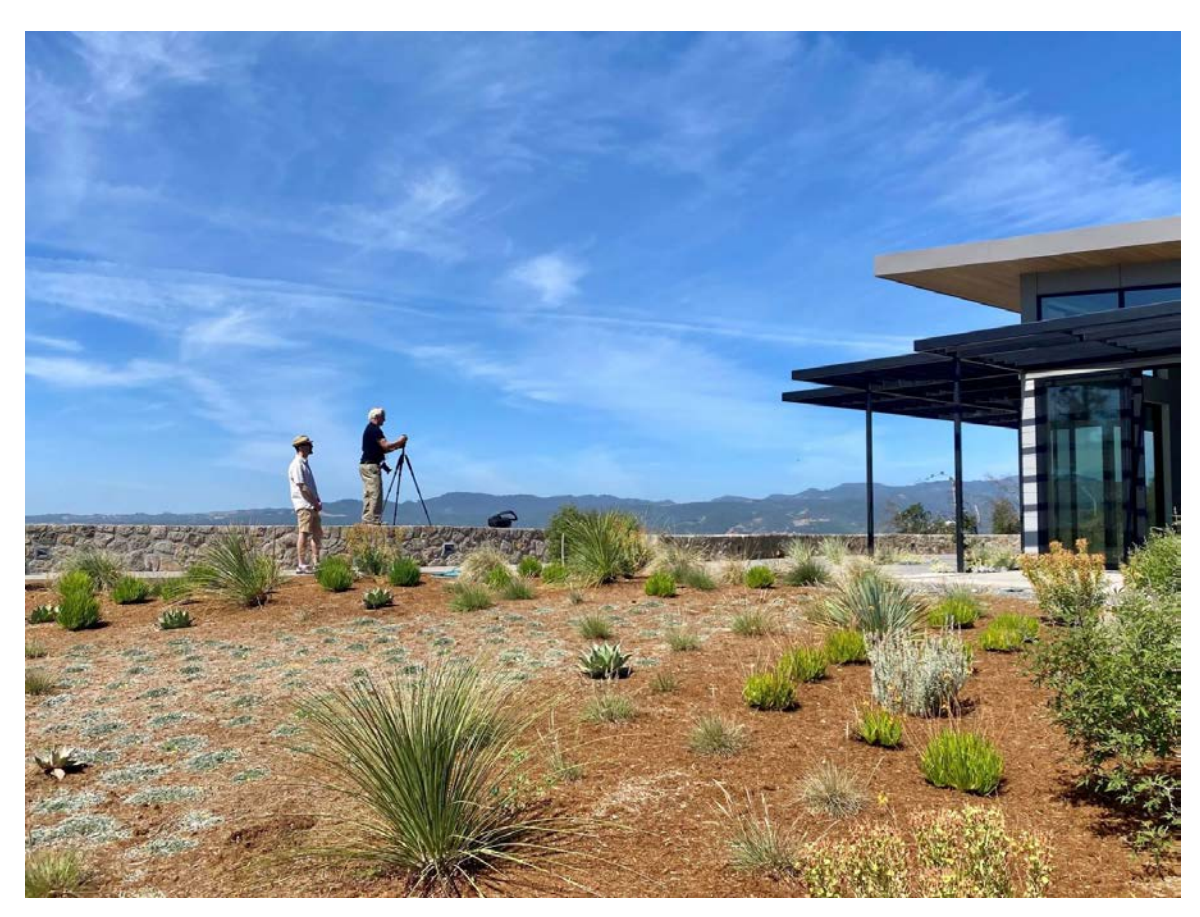
Our Own Photographer

Throughout the project the views have been opened up in concert with shading the interiors using roof overhangs and soon-to-be green covered trellises.