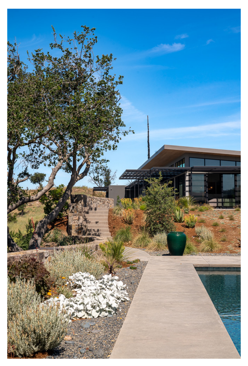
Responding to the Rocks

Only the rock wall and pool survived the conflagration - both have been updated in place. Perpendicular in orientation to its predecessor, the new main house is perched above the pool area with a burnt tree trunk standing memorial sentry in the background. Beautiful stone flooring flows throughout the house and blends seamlessly to meet the colored concrete patios making maintenance easy for our delightful clients and their beloved dogs.