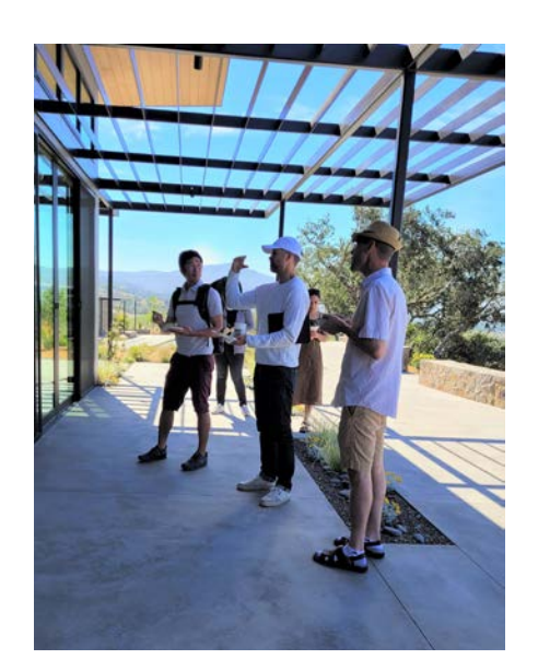
Views to the Horizon

Throughout the project the views have been opened up in concert with shading the interiors using roof overhangs and soon-to-be green covered trellises.